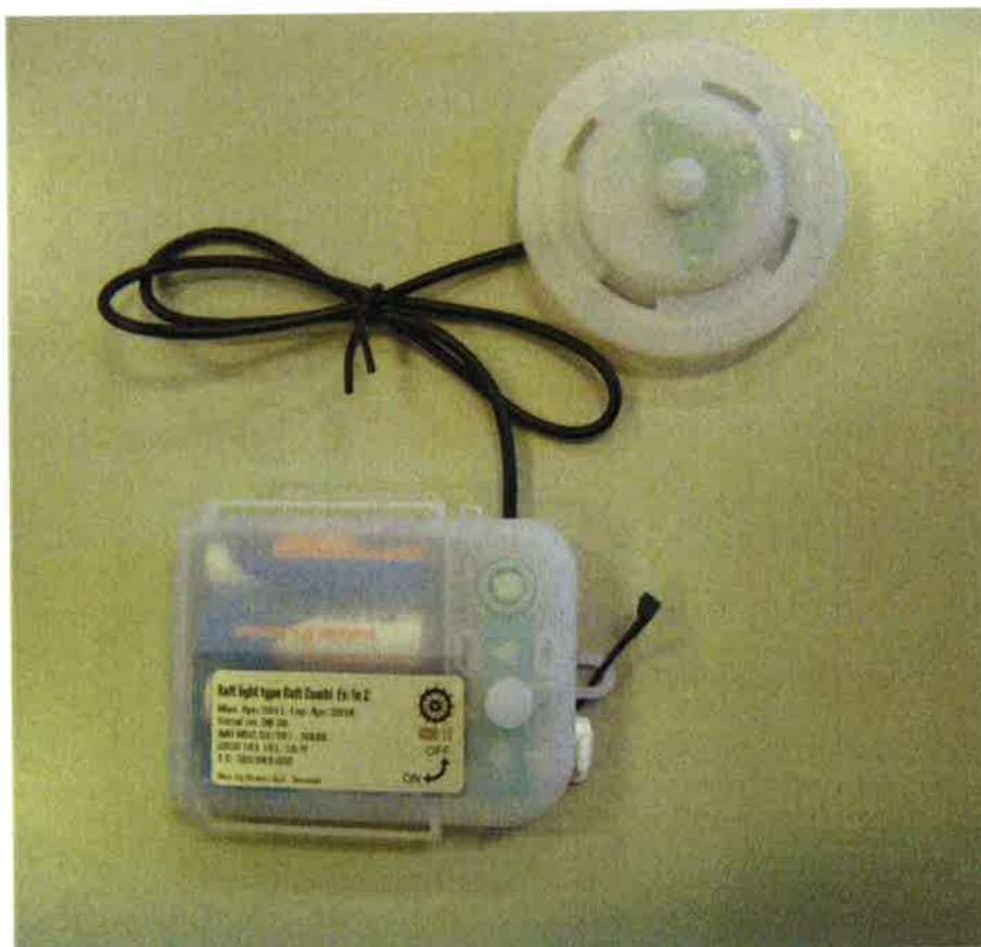
Raft Combi Ex/In 2